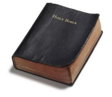
The Bible is the Word of God